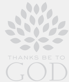
1 OPTION 1